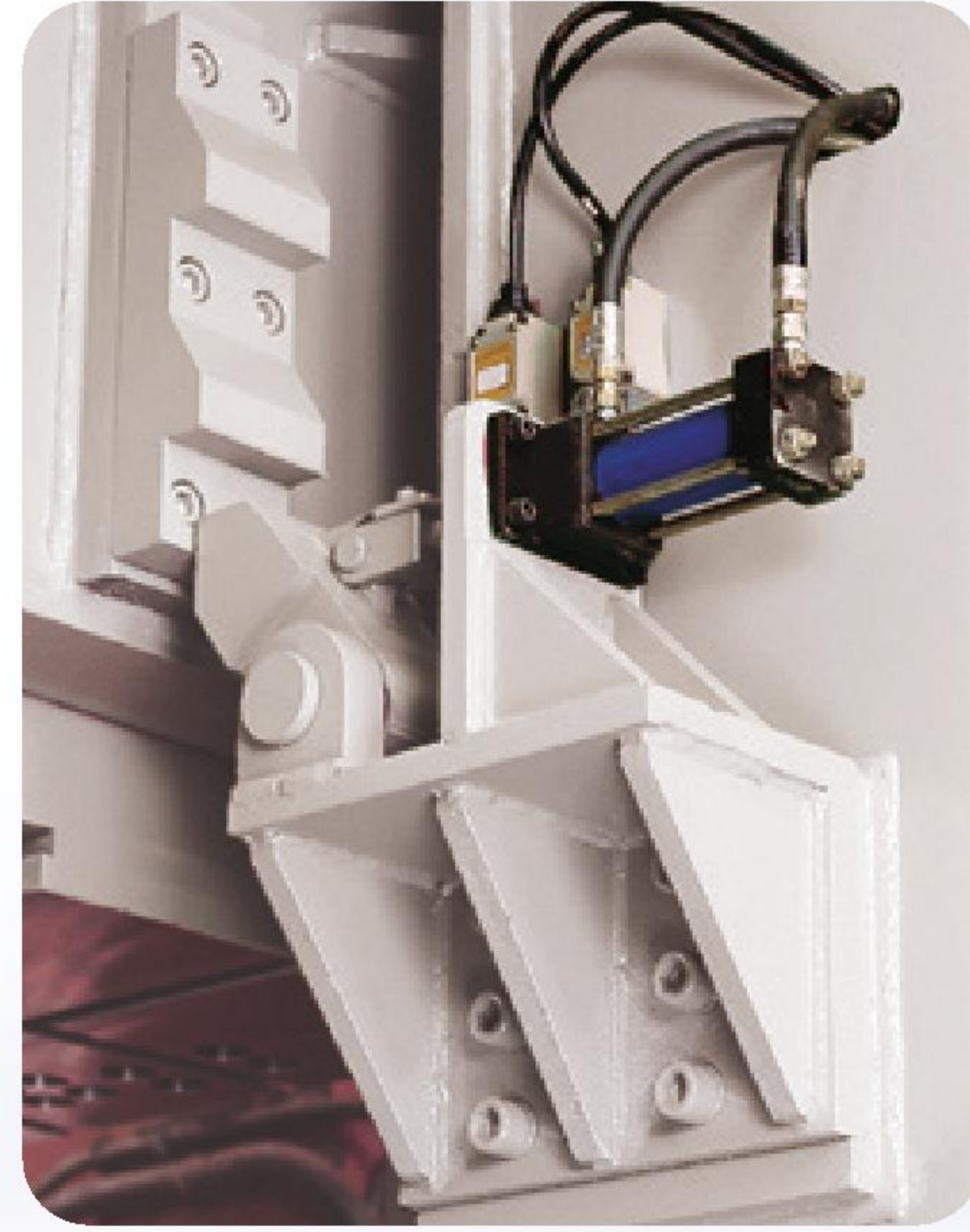
Anti-Falling Device 防落裝置

180° 反轉型合模機，使用於模具合模工作，並可用於初期試模小批量生產工程。合模加壓後，將下模具移出，可將上模移出並翻轉 180°，可安全的依合模情形精修模具。